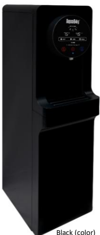
Black (color) ABP11-FB