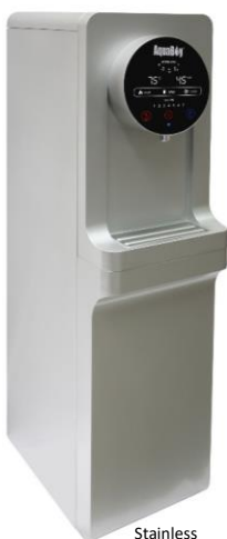
Stainless Steel (color) ABP11-FSS