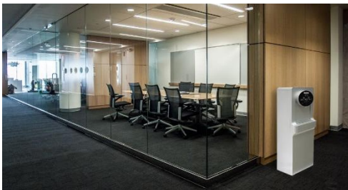
Outside of conference room