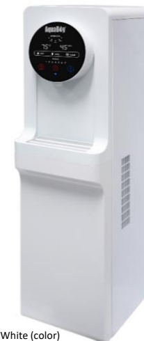
White (color) ABP11-FW

4-in-1 Appliance Atmospheric water generator Air dehumidifier Water purifier Air purifier