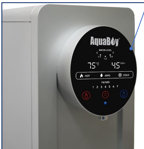
Advanced SmartScreen™ LED control panel