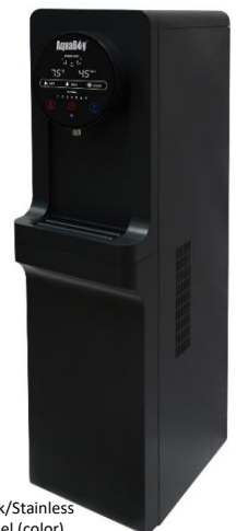
Black/Stainless Steel (color) ABP11-FBS